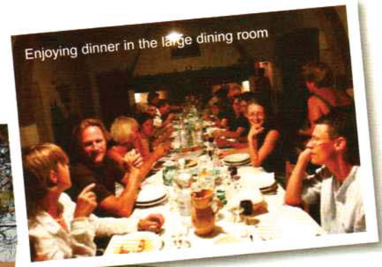
Enjoying dinner in the large dining room