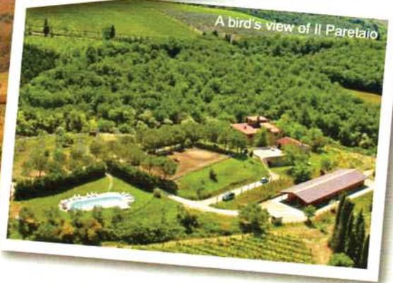
A bird's view of Il Paretaio