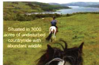
Situated in 3000 acres of undisturbed countryside with abundant wildlife

in spectacular surroundings, bring your own horse or use one of ours to explore the 70 miles of amazing off road hacking that Craigengillan offers.