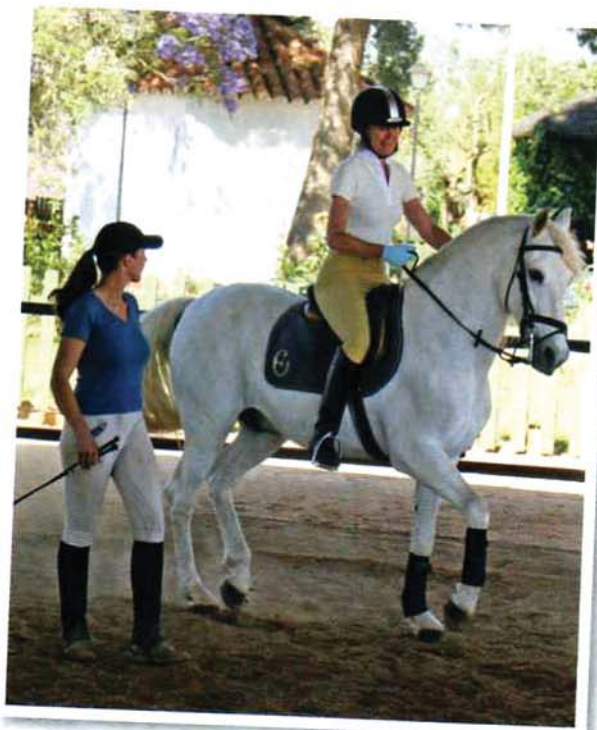
Experience classical dressage instruction on board an Andalusian schoolmaster.